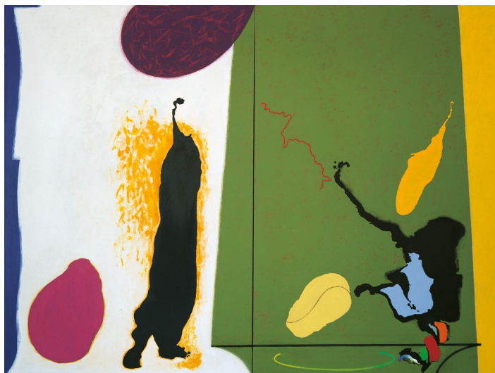
Paul Osipow, Turning , 1993–97