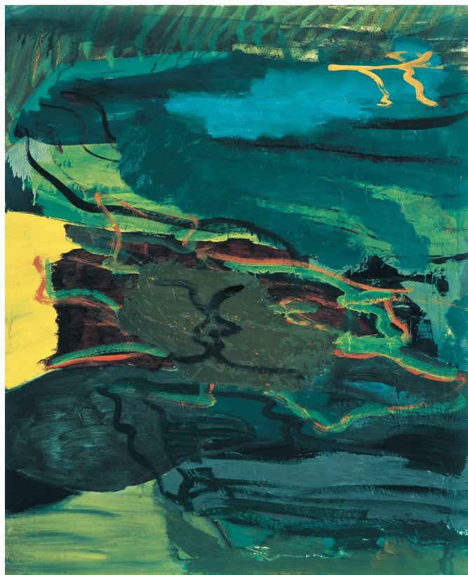
Per Kirkeby, Untitled , 1991