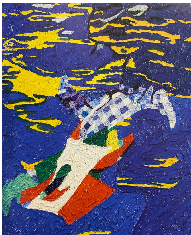
Ida Ekblad Cranial Rhythmic Impulse , 2020